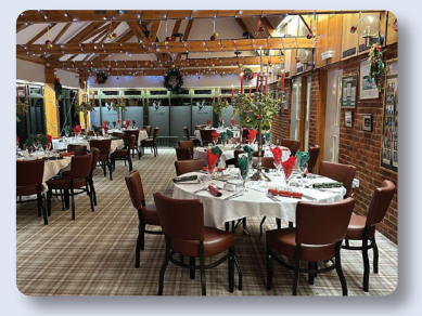
Twlefth Night Celebration