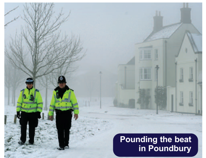
Pounding the beat in Poundbury

The Community Safety Plan also incorporates on-going work focused on addressing sexual violence, tackling hate crime, and preventing violent extremism.